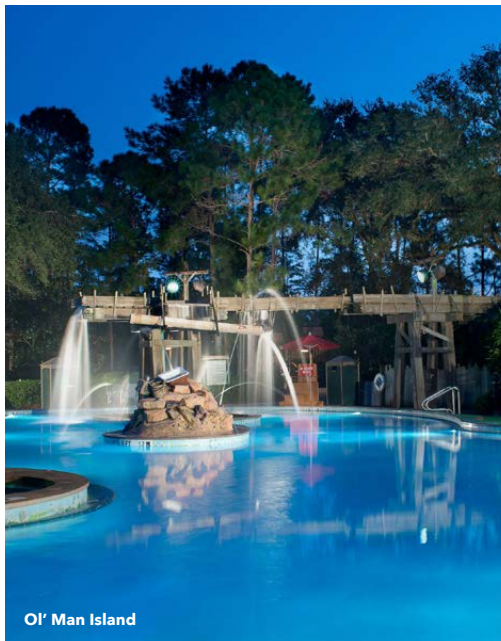
Ol' Man Island